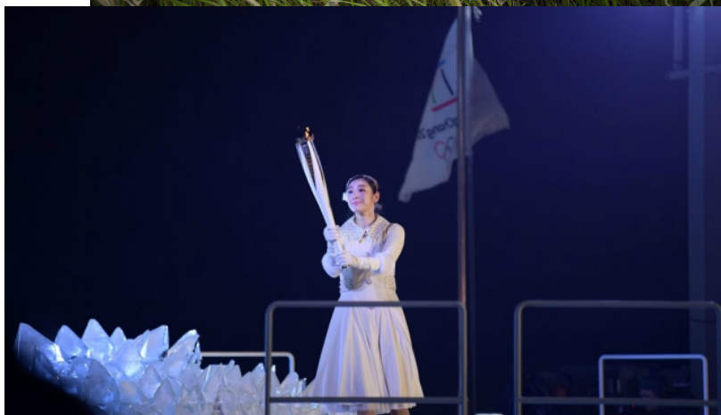
^I like the colors on this image