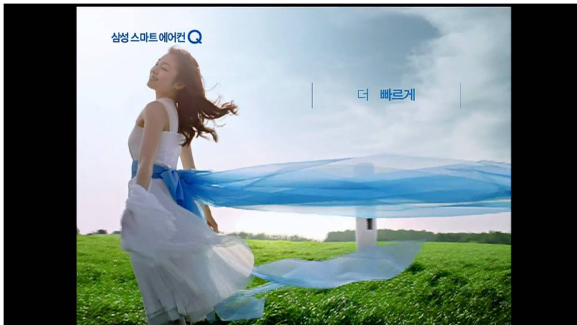
^This is brighter than what I had thought of. Bright colors may be used on other pages. I prefer more pastel colors on front page.